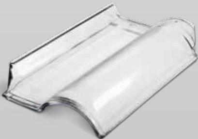
GLASS TILE SPANISH-S