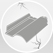
CRACKING & FADING RESISTANCE