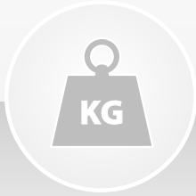
LOWER WEIGHT PER SQUARE